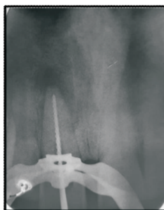
Figure 2: Preoperative Radiograph

No swelling or pus discharge was seen in relation to the concerned tooth and no relevant dental or medical history was found. Radiographic examination revealed an open apex along with a periapical radiolucency in relation to 11 [Figure 2].