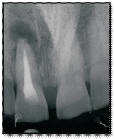
Figure 10: Immediate Post-operative radiograph

The access cavity was then restored with a composite restoration (Figure 10).