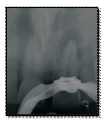
Figure 7: Radiograph depicting biodentine plug

The mixed Biodentine was carried into the canal with the help of a carrier and was condensed against the PRF matrix using hand pluggers to form an apical plug of 4 mm thickness, which was then confirmed radio graphically [Figure 7].