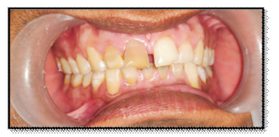
Figure 1: Preoperative clinical picture

A 26 -year-old male patient reported with a chief complaint of discoloured teeth and pain in the upper front right tooth. Patient gave a history of trauma 8 years back. Intraoral clinical examination revealed discoloration in relation to 11 [Figure 1].