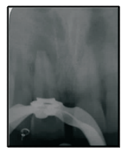
Figure 3: Working length radiograph

After isolation using rubber dam, access opening was done and working length was determined and kept 1 mm short of radiographic apex [Figure 3].