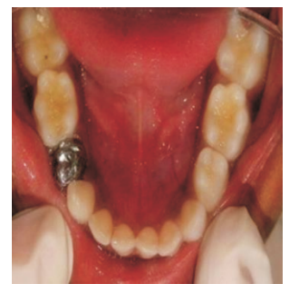
Fig 4.obturation followed by stainless steel crown

Further, in order to study the morphology of other molars, periapical radiographs (fig.5) and digital orthopantomogram (OPG) was taken (fig.6). Surprisingly, the left primary mandibular first molar and both primary maxillary second molars also had a single root and a single canal. Taurodontism was evident in the primary mandibular second molars. CBCT (Cone Beam Computed Tomography) was done in to confirm the findings (fig.7).