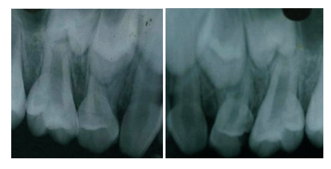
Fig 5. Upper Molar Radiographs

Further, in order to study the morphology of other molars, periapical radiographs (fig.5) and digital orthopantomogram (OPG) was taken (fig.6). Surprisingly, the left primary mandibular first molar and both primary maxillary second molars also had a single root and a single canal. Taurodontism was evident in the primary mandibular second molars. CBCT (Cone Beam Computed Tomography) was done in to confirm the findings (fig.7).