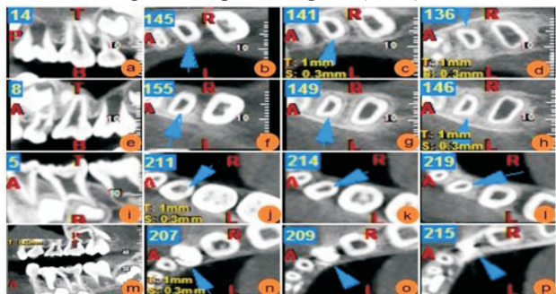
Fig 7:- Different CBCT views at different levels.