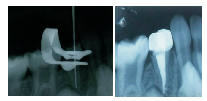
Fig 3. Working length determination