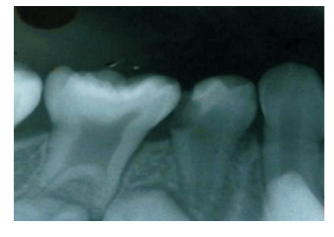
Fig 2. Single rooted 84 with radiolucency