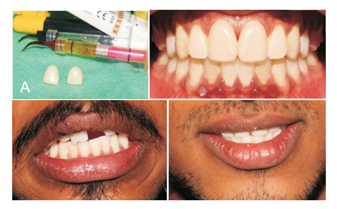
Fig. 6: B-Pre and Post Operative