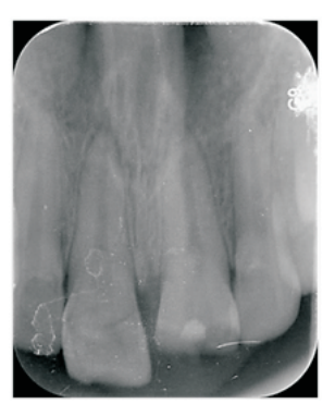
FIG 2: Fracture involving enamel dentin and pulp with fractured fragment remaining attachedirt 11, Fracture involving enamel dentin and pulpirt 21, Widening of PDL spaceirt 11 and 21

Radiographic examination revealed coronal fracture involving pulp irt 11 and 21. Single, intact root with single patent canal and widening of periodontal ligament space was noted. (FIG:2)Pulp sensibility tests showed negative response indicating nonvitality of 11 and 21 and no abnormal mobility was noted. Based on these findings, diagnosis of complicated crown root fracture irt 11 and complicated crown fracture irt 21 was arrived.