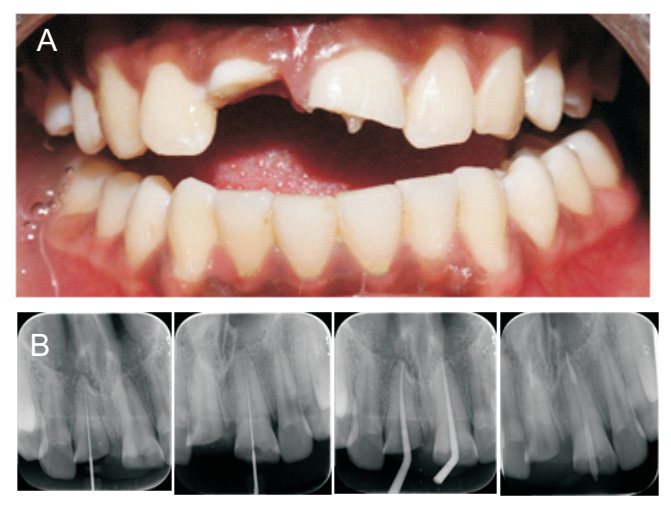
Lithium disilicate crowns were cemented using dual cure resin cement. (FIG 6: A-B)

Single visit Root canal treatment with sectional obturation was completed for both the central incisors. Fibre post was cemented and core build up was done for 21. (FIG 3 A-B) Periodontal surgery irt 11 was done to expose the fracture line and a full thickness Mucoperiosteal flap was carefully reflected and 1mm of ostectomy was performed only at the subgingival fracture area with diamond round burs. Gingival contour and zenith corrections were also carried out.Suspensory sling sutures were used to stabilise the periodontal tissue, reposition the flap and a periodontal dressing was placed. (FIG4: A-C) During the early healing process, the patient had to refrain from mechanical tooth cleaning in the treated area. For plaque control, 0.2% chlorhexidine was applied twice daily to reduce bacterial contamination for 2 weeks. At the post-operative examination, periodontal healing was noted to be ideal and uneventful. (FIG 4: D)EverStick post was selected for rehabilitation of 11and was cemented after moulding it according to the canal configuration and composite resin core build up and tooth preparation for full ceramic crowns was done(FIG 5:A-C).Crowns were fabricated according to the values obtained from digital mock up based on red proportion.