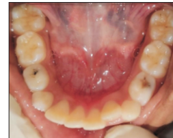
Figure 5: The intra-oral view of patient showing pit and fissure caries with mandibular right & left deciduous first molar