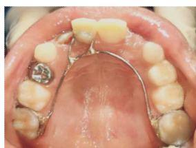
Figure 10: The space maintainer maxillary right incorporated with the natural tooth pontic cemented in maxillary arch