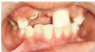
Figure 8: Crown exposure was performed using Diode laser

The mesiodistal dimension of the natural, avulsed tooth was adjusted as per the angulation of erupting maxillary right lateral incisor [Figure 9]. The palatal aspect of the avulsed tooth crown was then dried, acid-etched with 37% orthophosphoric acid for 20 s and rinsed with water for 15 s. It was air-dried and a light-curing adhesive agent was applied and subsequently, light-cured. A light-cure composite resin was used to attach the tooth with wire component, which was then photopolymerized for 40 s at several point. The appliance was tried and occlusion prematurities were removed. The palatal arch assembly was cemented in the maxillary arch using a glass-ionomer luting agent [Figure 10]. The patient was recalled after a week [figure 11] and thereafter is on a biannual follow-up.