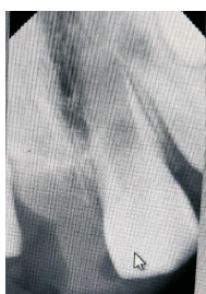
Figure 3: An IOPA confirming the avulsion of maxillary right central incisor

The deciduous lateral incisors had exfoliated a month back. Also, patient had proximal caries in maxillary right deciduous first molar and pit and fissure caries in mandibular right and left deciduous first molars [Figure 4&5]. History revealed that the avulsed tooth was found at the site of the mishap but