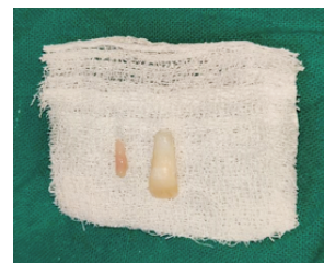
Figure 6: The avulsed immature tooth with extirpated pulp

Stainless steel orthodontic molar bands were adapted on the first permanent maxillary molars and alginate impressions were made for both maxillary and mandibular arch. Caries excavation was performed in relation to maxillary right deciduous first molar and a stainless crown was delivered with the same. A palatal arch and an additional wire extension was fabricated using a 0.9 mm round stainless steel wire. The wire extension was soldered to the palatal arch which was then soldered upon the orthodontic bands. In the subsequent visit, intra-orally an eruption swelling in relation to maxillary right lateral incisor was palpable and thus, crown exposure was planned [Figure 7]. A diode laser was used at a power of