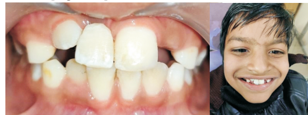
Figure 12 : 1 year post up

The appliance was adjusted according to the angulation of erupting lateral incisor in the subsequent visits. The patient has been comfortable with the appliance nearly 1 year after treatment [Figure 12].