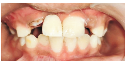
Figure 9: Mesiodistal dimension of central adjusted according to the exposed lateral incisor

The mesiodistal dimension of the natural, avulsed tooth was adjusted as per the angulation of erupting maxillary right lateral incisor [Figure 9]. The palatal aspect of the avulsed tooth crown was then dried, acid-etched with 37% orthophosphoric acid for 20 s and rinsed with water for 15 s. It was air-dried and a light-curing adhesive agent was applied and subsequently, light-cured. A light-cure composite resin was used to attach the tooth with wire component, which was then photopolymerized for 40 s at several point. The appliance was tried and occlusion prematurities were removed. The palatal arch assembly was cemented in the maxillary arch using a glass-ionomer luting agent [Figure 10]. The patient was recalled after a week [figure 11] and thereafter is on a biannual follow-up.