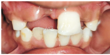
Figure 7: Eruption swelling in relation to maxillary right lateral incisor

1.5W in contact mode for crown exposure in order to assess the angulation of maxillary right lateral incisor [Figure 8].