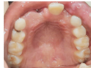
Figure 4: The intra-oral view of patient showing proximal caries with maxillary right deciduous first molar

unfortunately, deposited 3 days later. Since, the avulsed tooth had remained dry extra-orally for 72 h after the injury, replantation was not performed. The tooth was cleared of all dust and debris. The necrotic periodontal tissue attached to the root was chemically removed with sodium hypochlorite and finally, rinsed with sterile saline. The pulp was extirpated from the avulsed tooth [Figure 6] and the crown decoronated. The root canal access cavity was sealed with composite. The crown was transferred to sterile saline at room temperature.