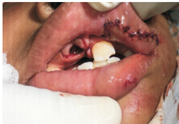
Figure 2: The intra-oral view of the patient showing missing maxillary right central incisor & an Ellis class I fracture in maxillary left central incisor and associated soft tissue injury