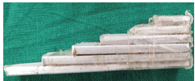
Figure 1: Aluminum stepwedge

An aluminum stepwedge (6063 alloy, 98% purity) ranging from 2.0 to 12.0 mm in thickness was used. It was constructed with 6 steps (with 2 mm increase in each step). Slices of aluminium were kept on top of each other vertically to construct a block. The aluminum step wedge was used as an internal standard for each radiographic exposure, which allowed the radiopacity of each material to be calculated in terms of aluminum thickness [Figure 1]