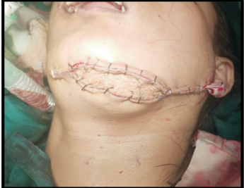
Figure 9: Immediate post-op