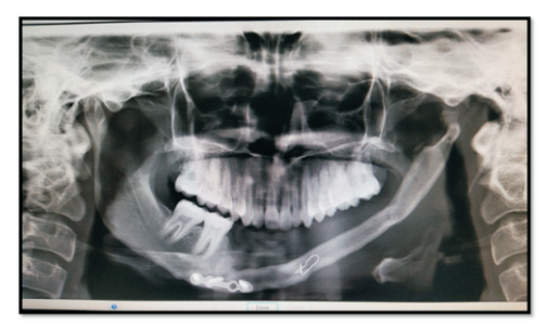
Figure 11: OPG six months post -op

University J Dent Scie 2022; Vol. 8, Issue 2