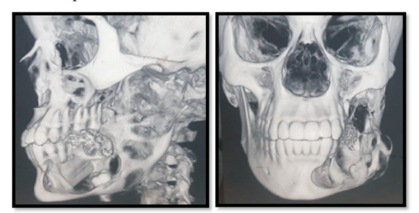
Figure 3: 3D CBCT showing bone resorption on affected side.