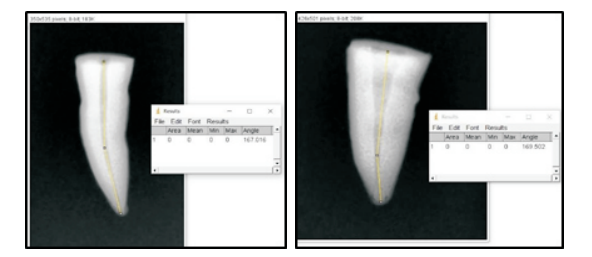
Figure 1: labio-lingual angulation with ImageJ software (a), mesio-distal angulation (b) with ImageJ software

Thirty single rooted premolars indicated for extraction for orthodontic reasons were used in the study. Study duration from December 2020 to February 2021, at Chhattisgarh Dental college and research institute, Rajnandgaon. Fully formed roots of mandibular premolar having curvature angles from "10° to 20°,5,10" and independent apical foramina were selected for the study. The roots were sectioned at the cementoenamel junction with a diamond disk (to produce root specimens with a standardized size of 13 mm. Curvature angle was measured using ImageJ software (Fig 1).