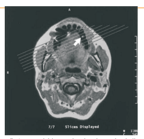
Figure 7: A transaxial image showing the marker indicating the potential implant site (arrow). The lines show the planned position of a set of images at right-angles to the maxilla at the site?