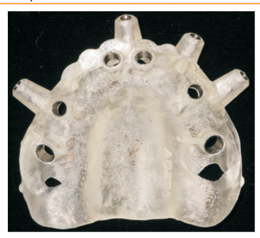
Figure 6: Stereo lithographic Model6