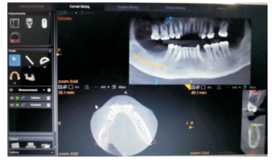
Figure 5 Cone-beam computed tomography (CBCT) [3]

The template helps in determining position and orientation of proposed implants.[13]