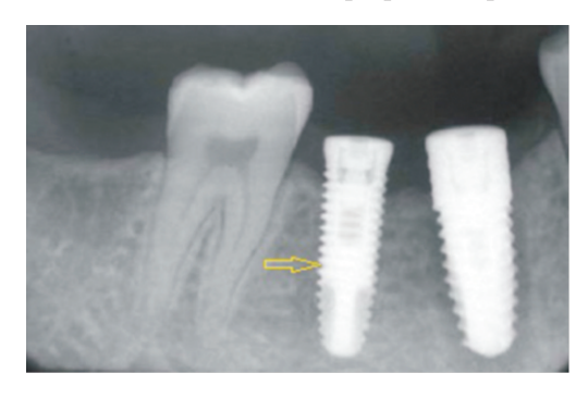
Figure 1: Periapical radiograph of the left mandibular posterior region shows the osseointegrated implant (arrows).[6]