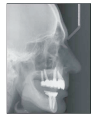
Figure 3: Cephalometric radiograph[3]