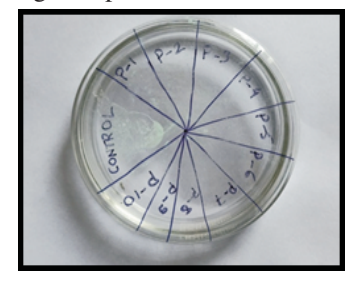
Figure 2: Glass petridish colonial growth (control group only)