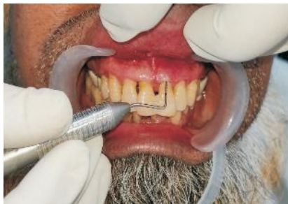
Fig. 1(a) Clinical view of chronic periodontitis with COVID 19 patient