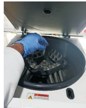
Fig. II (b) Blood samples to keep in centrifuged machine for isolation

Blood samples were stored in a storage vial box containing a dry ice pack, before being transferred and stored in a freezer at -70^{\circ}\text{C} . Serum IL-6 assays were determined in plasma samples by Chemiluminescence immunoassay using Roche Company (Made in Japan) in Pathkind Lab, Ranchi, Jharkhand, India. The lower detection limit of this kit is 1.5 pg/ml, and the upper detection limit is 5000 pg/ml without dilution. The normal upper limit is 7 pg/ml.