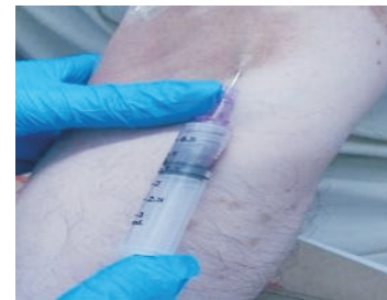
Fig. 11(a) Sample collection from COVID 19 patient

At 08:00 a.m., a fasting venous blood was collected from each subject in ethylenediamine tetraacetic acid (EDTA)-containing tubes. Tubes were immediately put on ice, centrifuged, and serum isolated within two hours.