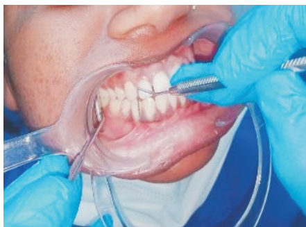
Fig. 1(b) Clinical view of patient without chronic periodontitis in COVID 19 patient