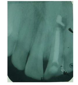
Fig 2. Follow up after 6 MONTHS