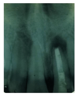
Fig 1. Pre-op IOPA