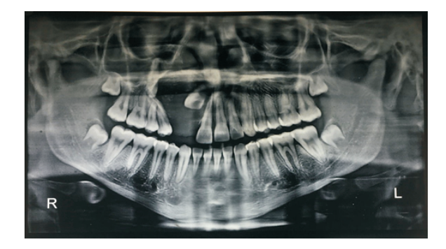
Figure 1: Photograph of orthopantomogram showing unilocular radiolucency with impacted 12, 13 and displaced 14 (distally displaced root) with flecks of calcification

The patient was advised surgery under general anaesthesia, the lesion was surgically enucleated along with impacted 12 and 13 and was sent for histologic analysis.