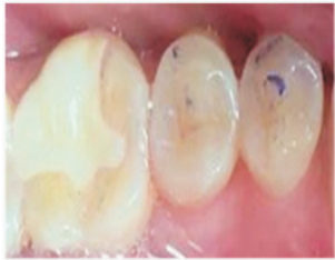
Fig:6- cementation of prosthesis