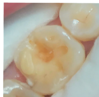
Fig:2- After preparation