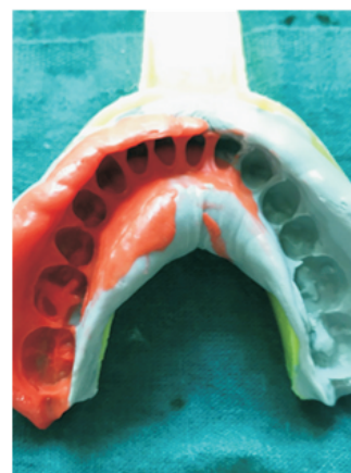
Fig:3- silicone impression