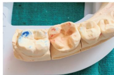
Fig:4- master cast