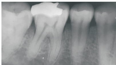
Fig: 8- After 1 month