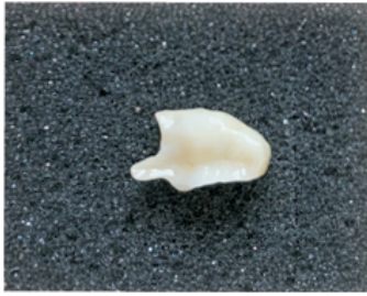
Fig:5- BruxZir prosthesis