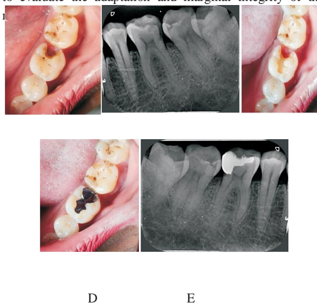
Figure 1: (a) pre-operative clinical picture #36(b) Pre op radiograph (c) Metal inlay cavity preparation (d) post-cementation clinical picture (e) Post cementation periapical radiograph

Caries was excavated, and an inlay cavity preparation was carried out [Figure 1c)maintaining a depth of 1–1.5 mm to ensure adequate resistance and retention form. Tapered fissure bur 169L (MANI, Inc., Tochigi, Japan ) was used to achieve a wall divergence of 2-5 degrees, and finishing bur no. 8862 (Komet USA) was used to create bevels along the cavosurface margins. Following the preparation, an impression was made using polyvinyl siloxane material. The lab fabricated inlay was try- in to assess fit and occlusion, and subsequently luted by Glass ionomer cement type I ( FujiCEM (GC)(fig 1 d). A postoperative radiograph was taken to evaluate the adaptation and marginal integrity of the